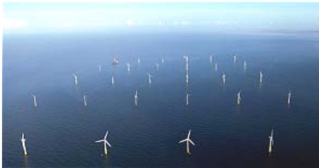
The 60-megawatt North Hoyle project off the coast of Wales is typical of today's offshore wind farms. Installed in May 2003, it consists of thirty Vestas 2-MW turbines, each having a rotor diameter of 80 meters. This project occupies an area of six square kilometers.

Offshore wind energy is the most commercially mature of the marine renewable energy technologies, with Denmark, Germany and the United Kingdom being particularly active in its deployment. Nearly thirty offshore wind projects are under development in the UK, and these could supply more than 8% of that nation's annual electricity demand in the coming decade.